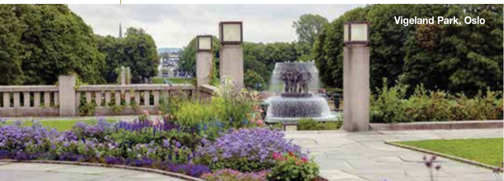
Vigeland Park, Oslo