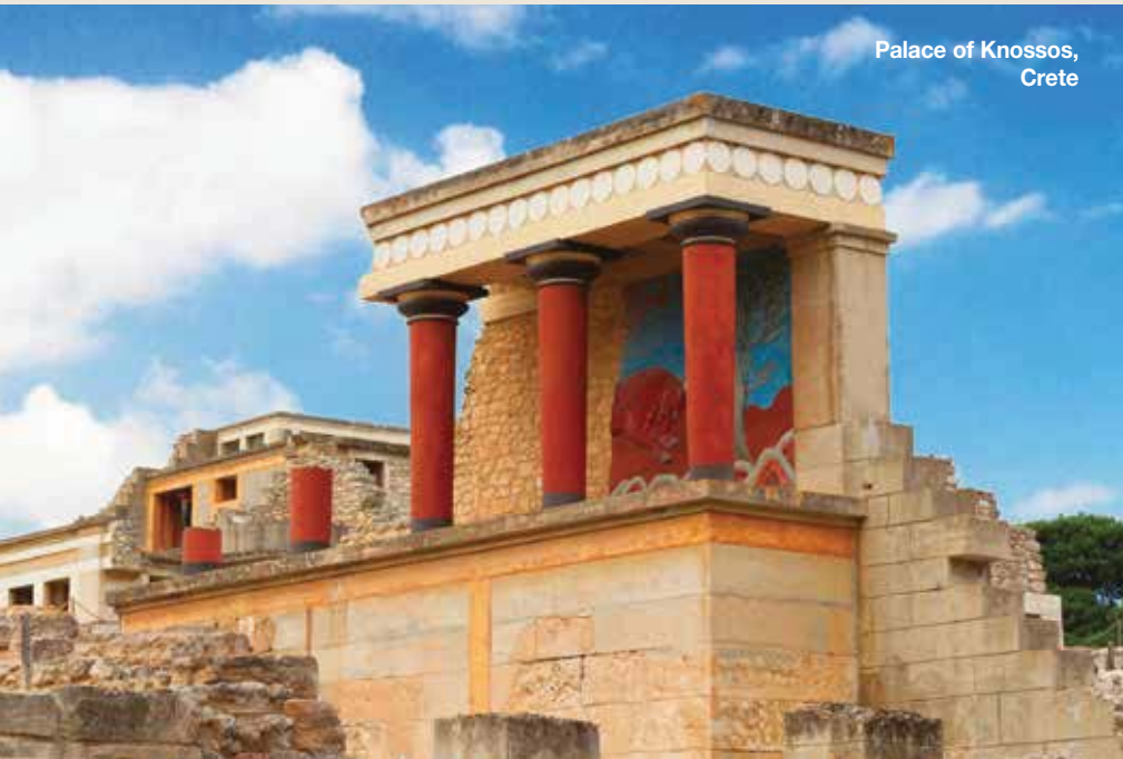
Palace of Knossos, Crete