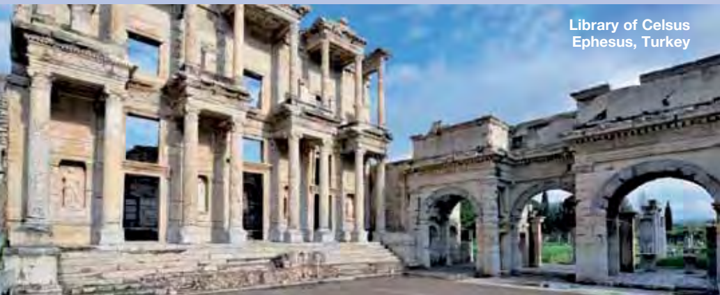
Library of Celsus Ephesus, Turkey

The agreement in this brochure is the exclusive and entire statement of the agreement between you and Go Next, Inc. It should be read carefully.