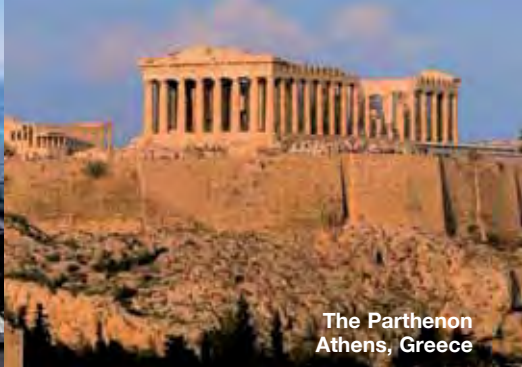
The Parthenon Athens, Greece