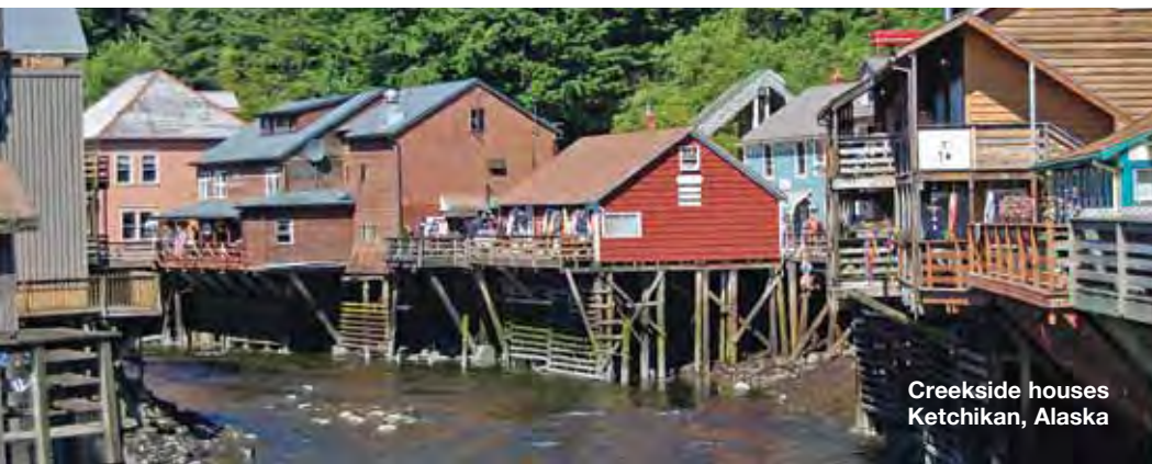
Creekside houses Ketchikan, Alaska

Each day on board can be as relaxing or action-packed as you desire. Choose from an exciting collection of free shore excursions that provide unique opportunities to experience the world in a more intimate way. Or spend the day renewing body and mind aboard the ship. Revitalize at the Canyon Ranch SpaClub®, enjoy a few laps in the pool, or practice your golf swing as you look out into spectacular scenery. Hone your skills in contract bridge, explore your interest in history or art with the onboard lecturers, or take a computer class. Make each day a perfect day.