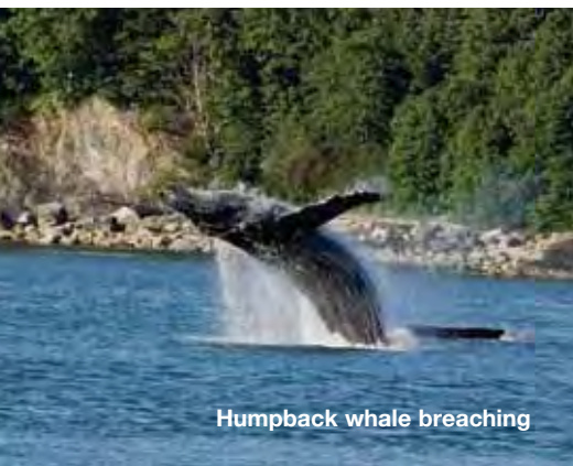
Humpback whale breaching

All Seven Seas Navigator suites feature a European king-size Suite Slumber Bed™ (which can be converted to a twin bed configuration), walk-in closet, marble-appointed bathroom, plush bathrobes and slippers, hair dryer, interactive flat-screen TV with extensive media selection, 24-hour room service, safe, bottle of champagne, and a mini-bar replenished daily with soft drinks, beer, and bottled water.