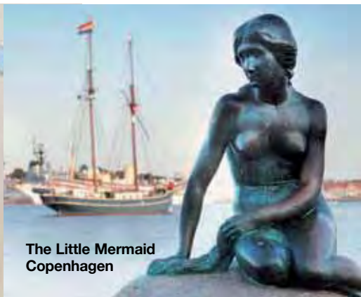
The Little Mermaid Copenhagen