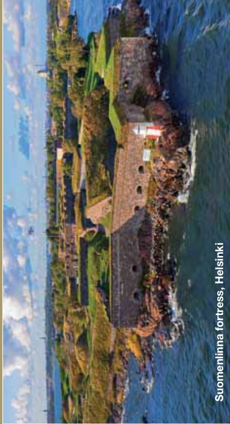
Suomenlinna fortress, Helsinki

8000 West 78th Street, Suite 345 Minneapolis, MN 55439-2538