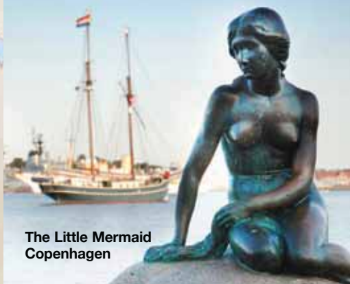
The Little Mermaid Copenhagen