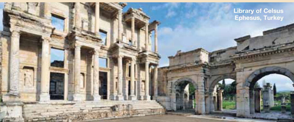
Library of Celsus Ephesus, Turkey

The agreement in this brochure is the exclusive and entire statement of the agreement between you and Go Next, Inc. It should be read carefully.