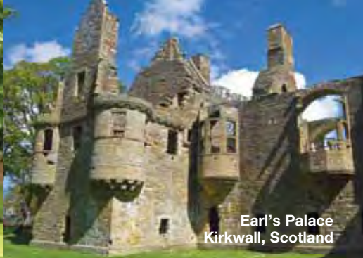
Earl's Palace Kirkwall, Scotland