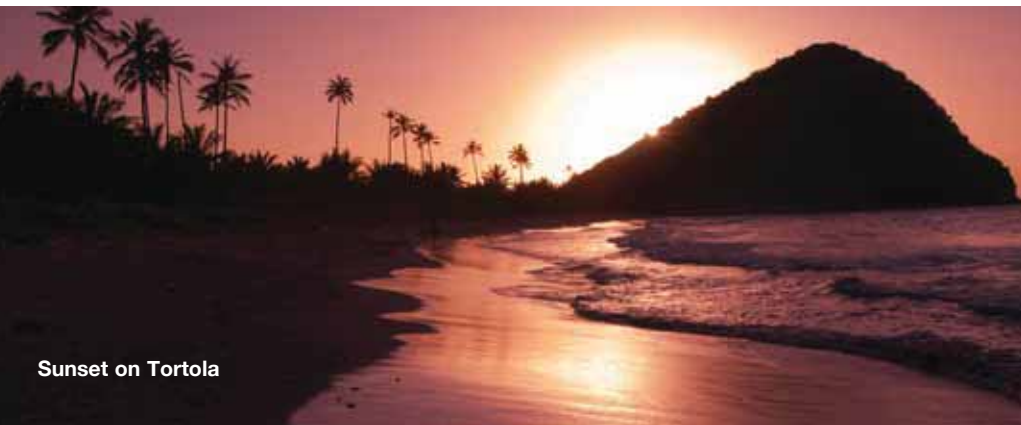
Sunset on Tortola