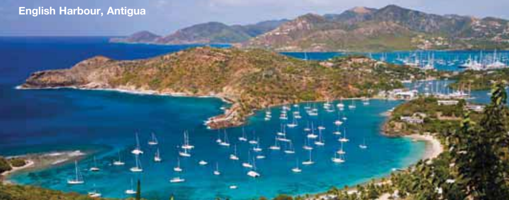
English Harbour, Antigua

The agreement in this brochure is the exclusive and entire statement of the agreement between you and Go Next, Inc. It should be read carefully.