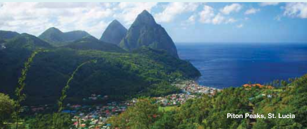
Piton Peaks, St. Lucia