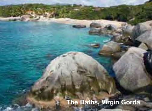
The Baths, Virgin Gorda