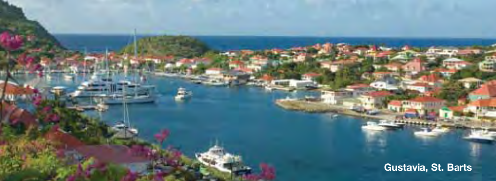
Gustavia, St. Barts