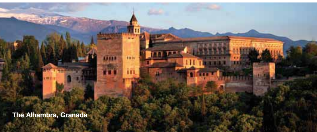
The Alhambra, Granada