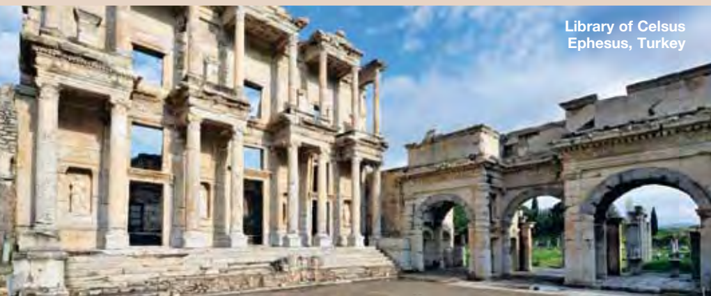
Library of Celsus Ephesus, Turkey

The agreement in this brochure is the exclusive and entire statement of the agreement between you and Go Next, Inc. It should be read carefully.