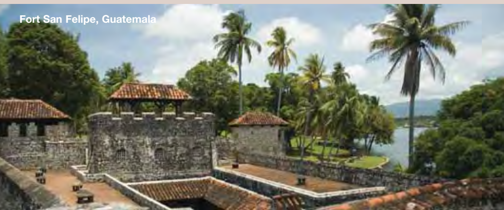
Fort San Felipe, Guatemala

The agreement in this brochure is the exclusive and entire statement of the agreement between you and Go Next, Inc. It should be read carefully.