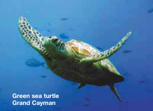
Green sea turtle Grand Cayman