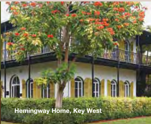
Hemingway Home, Key West