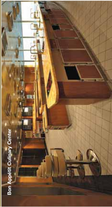
Bon Appétit Culinary Center

WITH A MAYAN MYSTIQUE LUXURY CRUISE INCLUDING FREE AIRFARE!