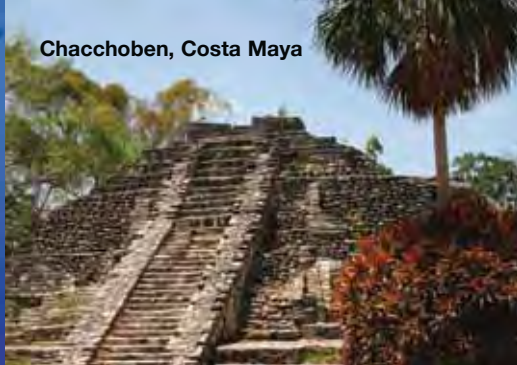
Chacchoben, Costa Maya