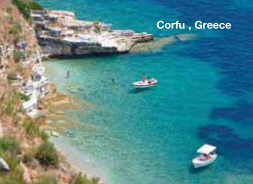
Corfu , Greece