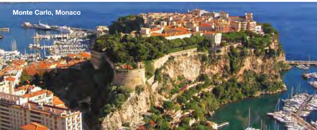
Monte Carlo, Monaco