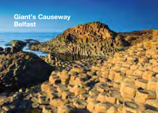
Giant's Causeway Belfast