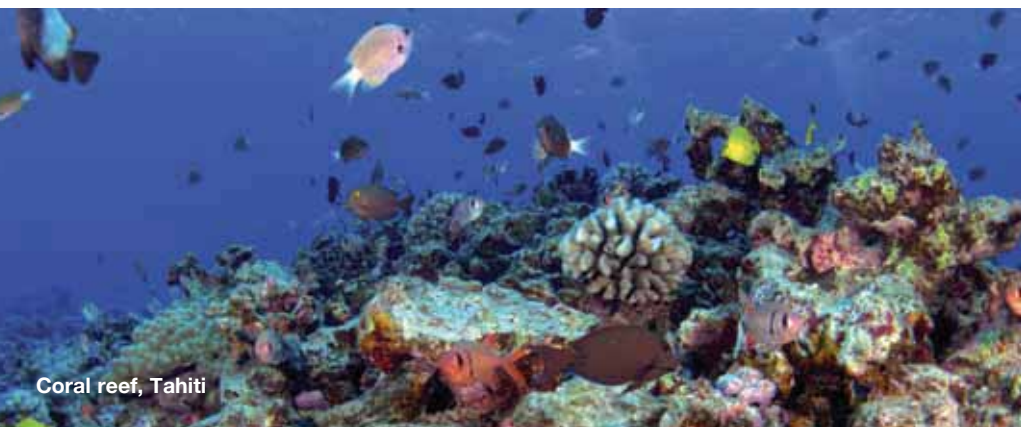
Coral reef, Tahiti