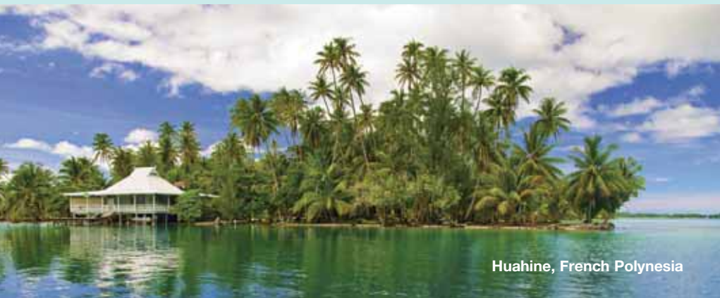
Huahine, French Polynesia

All air, cruise, and land accommodations, local transportation, and optional shore excursions are arranged by Oceania Cruises, who may use other suppliers or providers to render the services. The agreement in this brochure is the exclusive and entire statement of the agreement between you and Go Next, Inc. It should be read carefully.