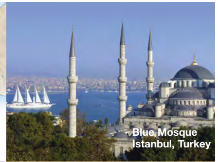
Blue Mosque Istanbul, Turkey