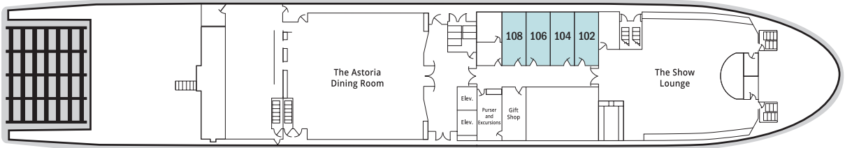
DECK 1 EXPLORER DECK The Show Lounge Gift Shop Purser and Excursions The Astoria Dining Room Staterooms

The largest, most elegant paddlewheeler cruising the Pacific Northwest, she hosts 217 guests on voyages following the historic route of Lewis and Clark. In addition to an inclusive range of educational enrichment and hospitable services, she boasts a dazzling collection of unique paintings and Native American art.